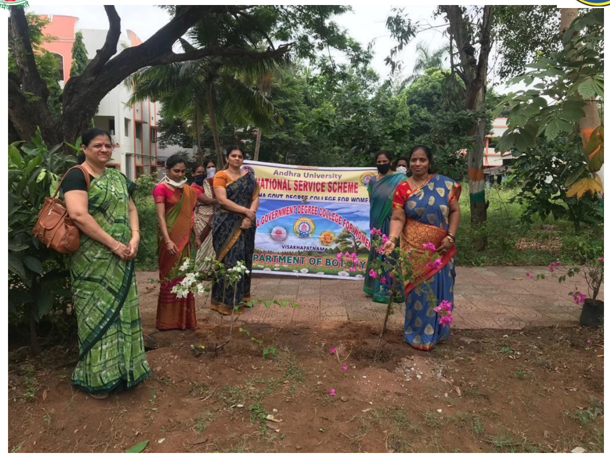
Plantation program in college campus conducted by Department of Botany, Green club and NSS On World Environment Day 5 June 2020