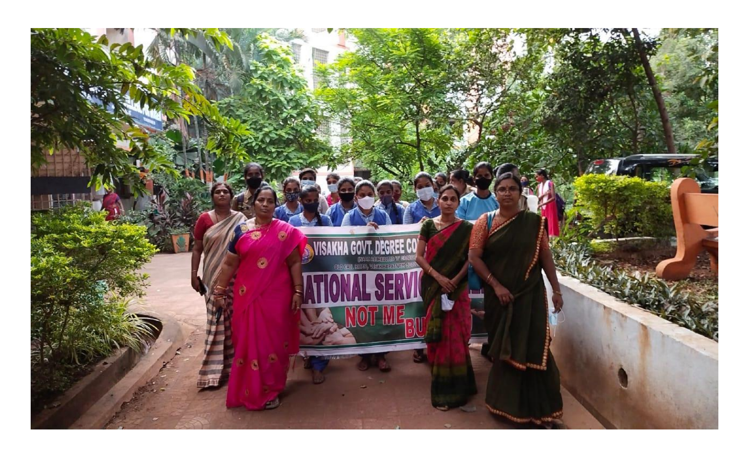
Principal, NSS officers with students participating in SAY NO TO PLASTIC CAMPAIGN